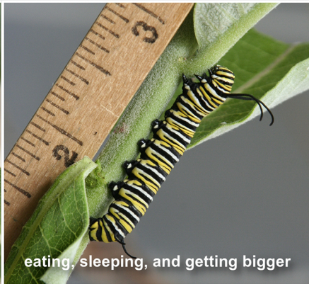
eating, sleeping, and getting bigger