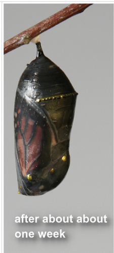
after about about one week