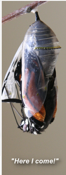
"Here I come!"