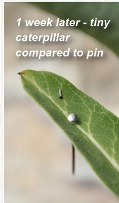
1 week later - tiny caterpillar compared to pin