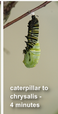
caterpillar to chrysalis - 4 minutes