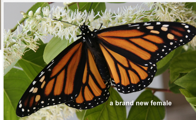
a brand new female