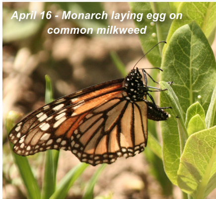
April 16 - Monarch laying egg on common milkweed