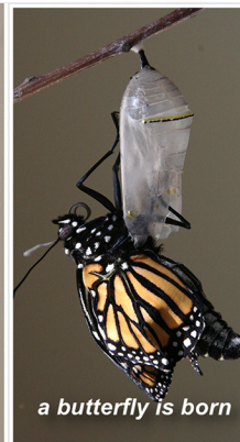
a butterfly is born